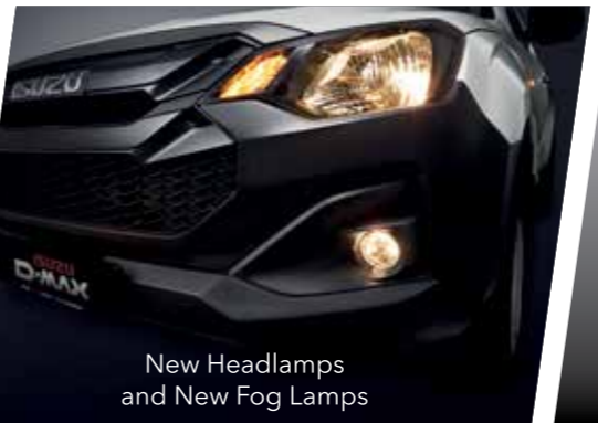
New Headlamps and New Fog Lamps