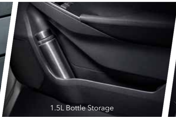
1.5L Bottle Storage