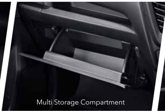
Multi Storage Compartment