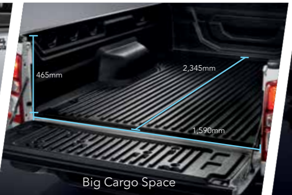
Big Cargo Space