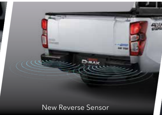
New Reverse Sensor