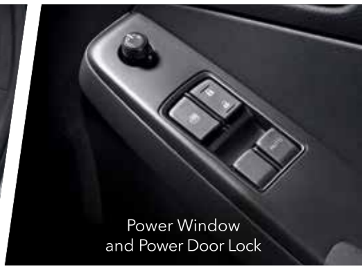
Power Window and Power Door Lock