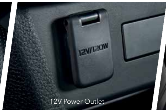
12V Power Outlet