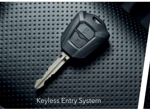
Keyless Entry System